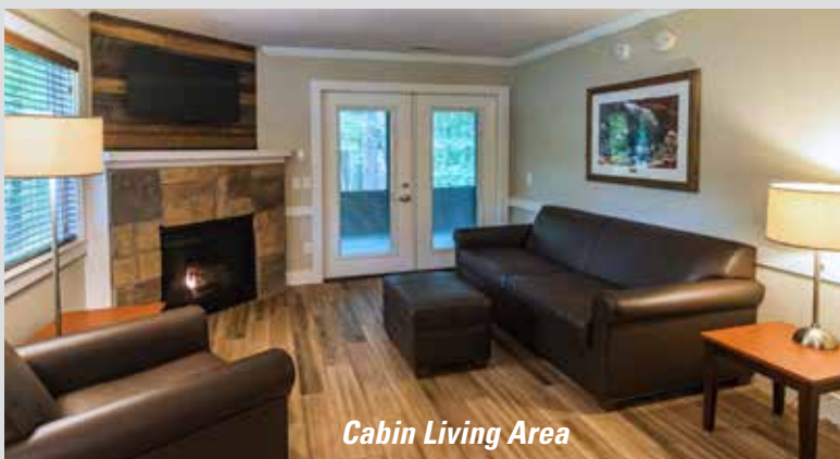
Cabin Living Area