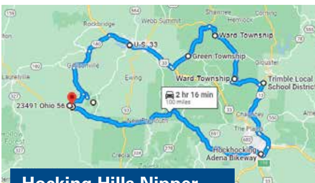
Hocking Hills Nipper (Ohio's Windy 9) 93 Miles