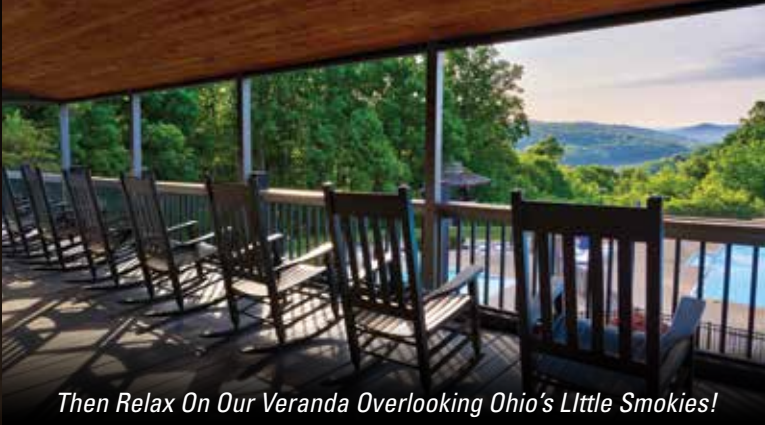
Then Relax On Our Veranda Overlooking Ohio's Little Smokies!

Discover all of Ohio's wonders on our scenic byways and drives.